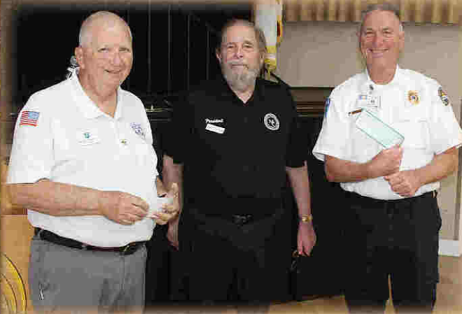
Pictured L to R: