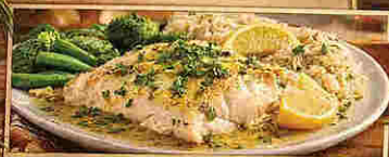
BAKED COD w/ LEMON HERB BUTTER SAUCE

Doors open at 10:45 am | Meeting concludes approximately 1:00 pm