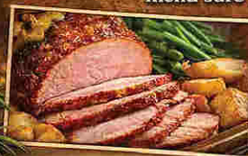
CARVED SUGAR-GLAZED BAKED HAM

This month's luncheon features a delicious chef-prepared menu sure to please every appetite: