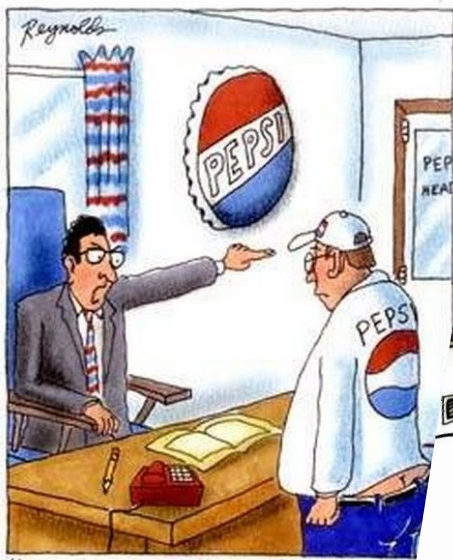
"You're fired, Jack. The lab resu just came back, and you teste positive for Coke."