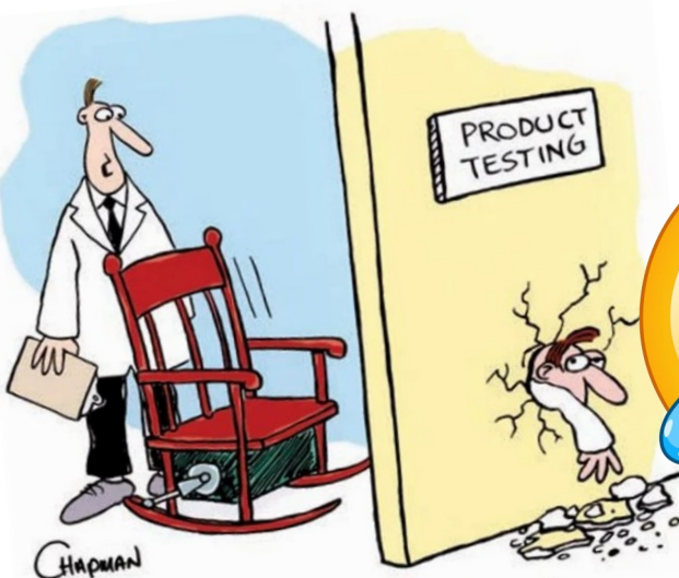
"Okay, the motorized rocking chair could use an emergency 'off' switch."

It's OK to pretend we're Irish on St. Patrick's Day. We pretend we're GOOD on Christmas don't we?